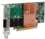
Omni-Path Host Fabric Adapters from Aspen Systems Inc.

www.aspsys.com/solutions/networking/intel-omni-path/